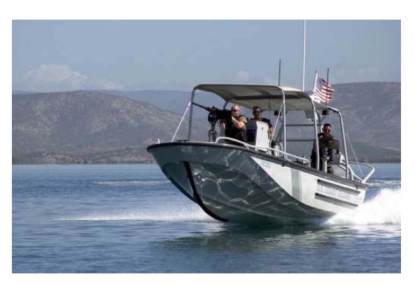
Transportable Port Security Boat