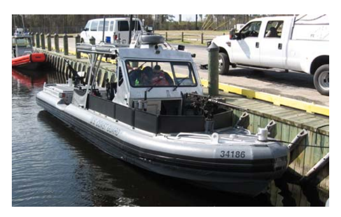
Generation IV Transportable Port Security Boat

The current generation of TPSBs is being replaced during FY 2012 with the Generation IV TPSB. The new TPSB will allow for a significant increase in capability and performance when compared to the current Generation III TPSB. Due to its larger size and platform configuration, the new generation TPSB can operate in rougher sea states while incorporating better offensive and defensive capabilities. The Coast Guard intends to deliver 48 boats to PSUs and an additional 7 boats to the Special Missions Training Center in Camp Lejuene, North Carolina by the end of FY 2012.